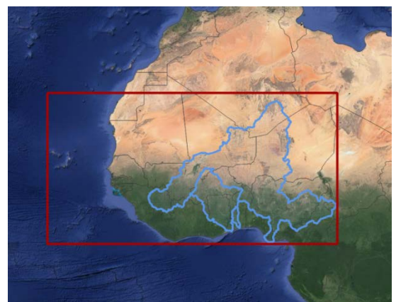
Figure 2: Climate modelling domain (red box), Niger, Volta, and Mono River basins (blue areas).